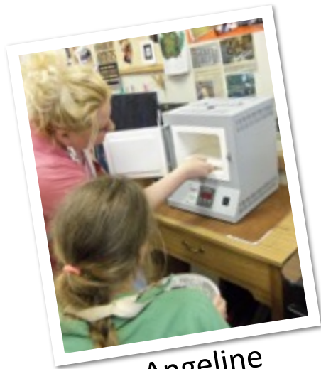
Angeline Art Connection